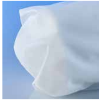
Optional polyamide 6.6 mesh cover in 10 µm forms a protective outer shield