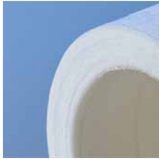
Graded media structure yields gradual loading