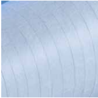
Endless fiber structure limits fiber migration at a bare minimum