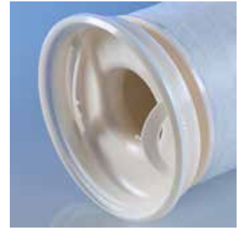
Bypass-free sealing through SENTINEL seal ring