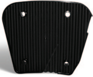
Bio-Wheel™ aeration cell