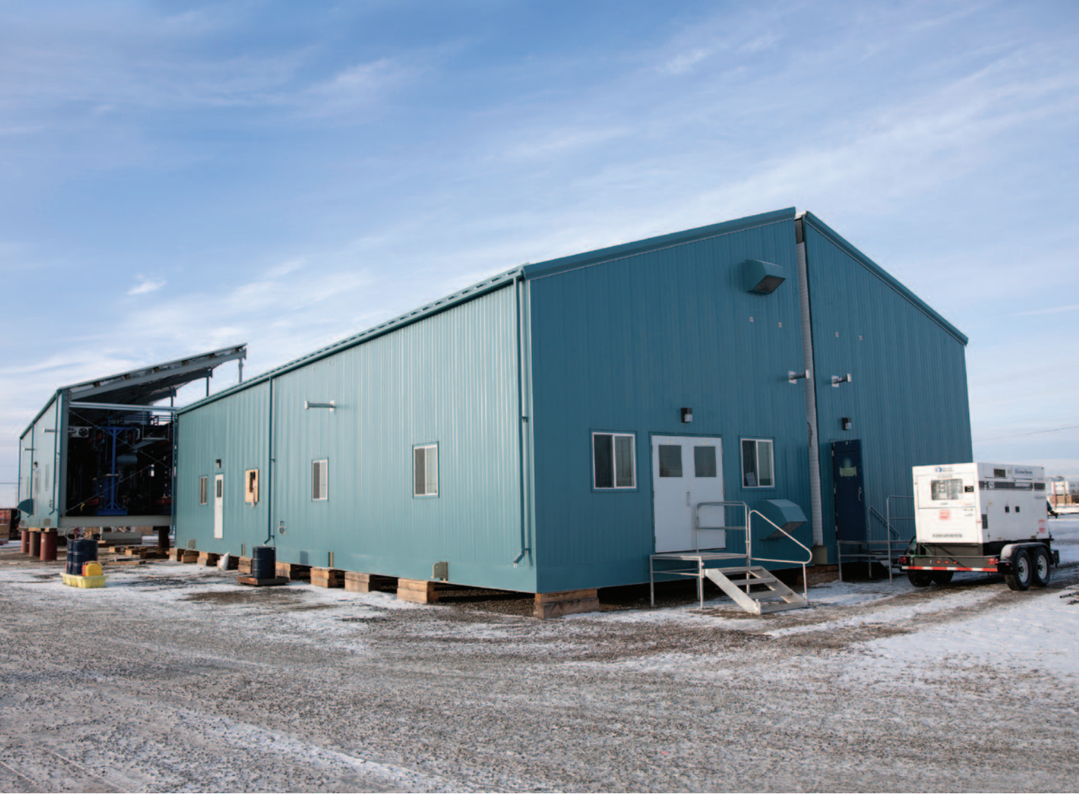
SUNCOR'S FORT HILLS WORKERS' CAMP FORT McMURRAY, ALBERTA, CANADA