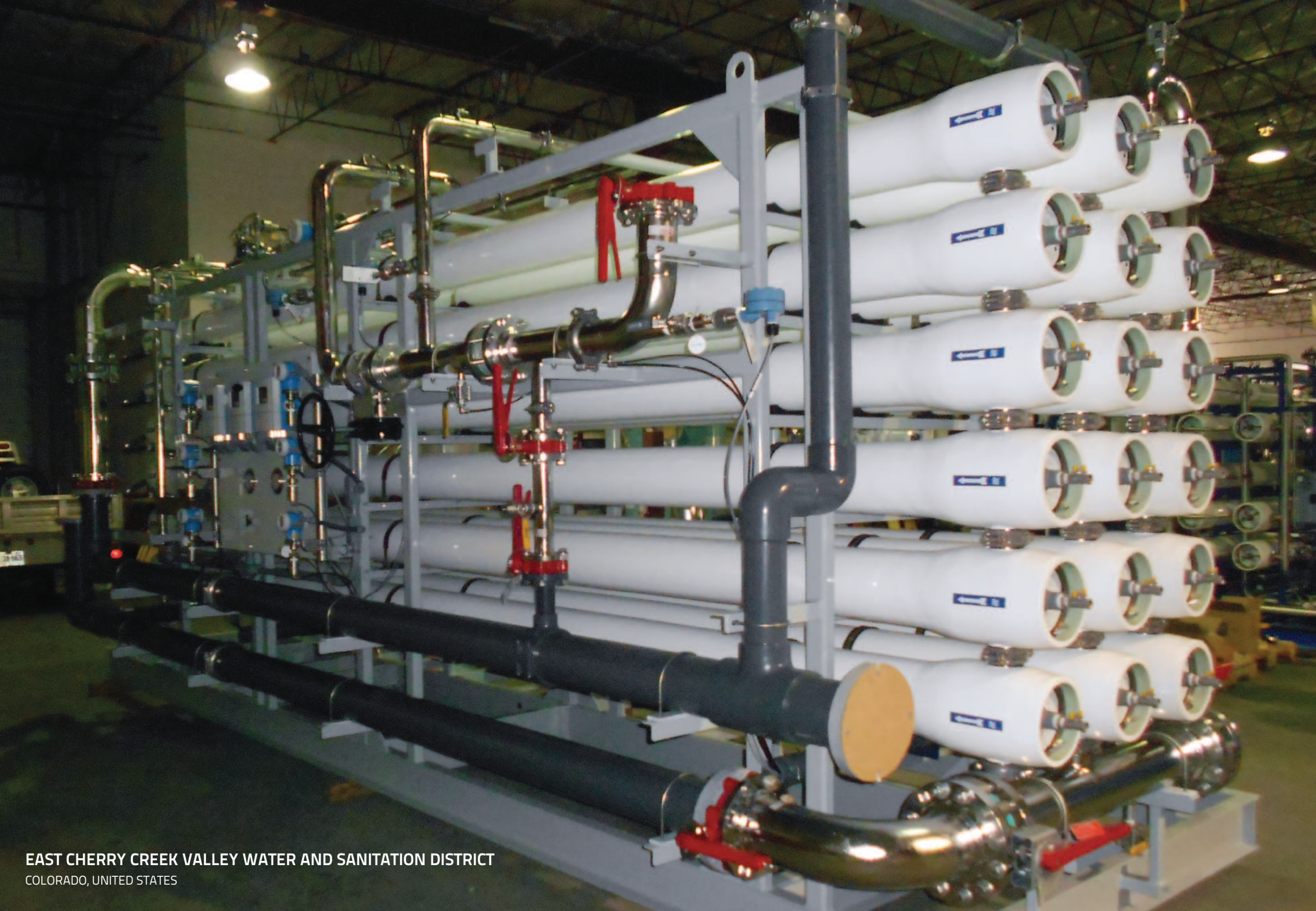
EAST CHERRY CREEK VALLEY WATER AND SANITATION DISTRICT COLORADO, UNITED STATES