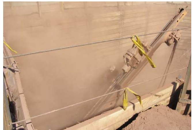
Example of dust build-up on a drill

Please contact: Applications Engineering ( appeng@bete.com ) 413-772-0846 App#060731