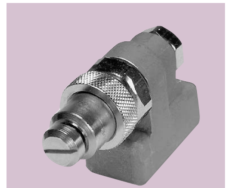
1/4" XA 03 XW050 A XA 03 Body; A Hardware

CALL 413-772-0846 Call for the name of your nearest BETE representative.