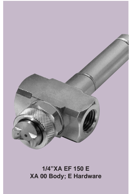
1/4" XAEF 150 E XAEF 00 Body; E Hardware

Dimensions are approximate. Check with BETE for critical dimension applications.