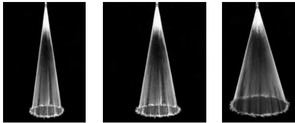
Hollow Cone 15°