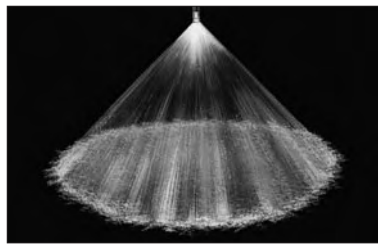
Full Cone 90° (M)