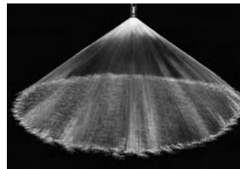
Full Cone 120° (W)

Dimensions are approximate. Check with BETE for critical dimension applications.