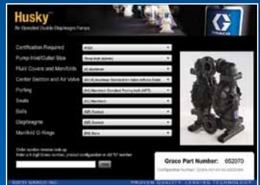
Example of Product Selector Tool

To order a Husky 3300 pump, go to www.graco.com/husky to use the selector tool or contact your distributor.