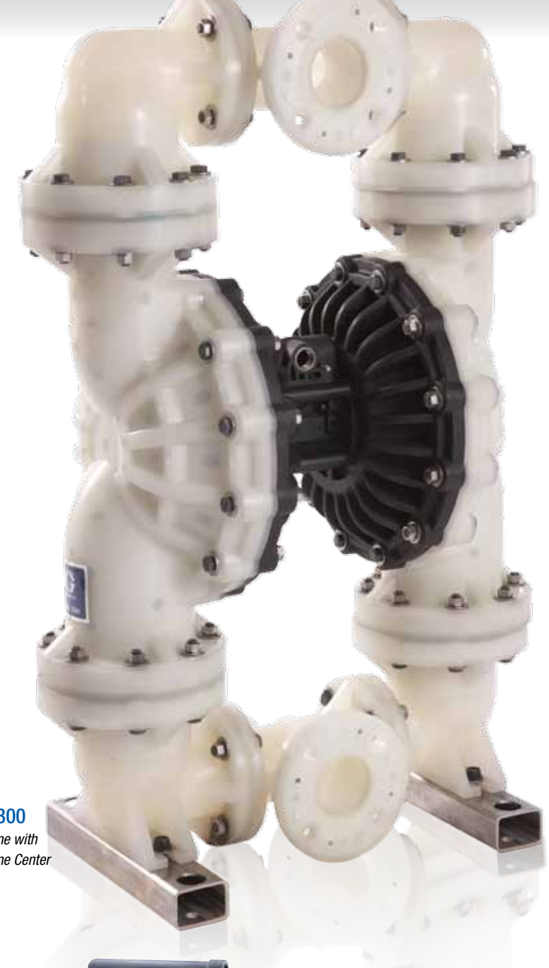
Husky 3300 Polypropylene with Polypropylene Center

DataTrak<sup>™</sup> available to prevent pump runaway and track material usage