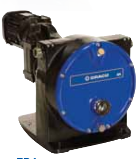
EP4 Max flow: 19.5 gpm (73.8 lpm) Ideal for abrasive material transfer applications