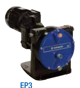
Max flow: 6.2 gpm (23.6 lpm) Typically used for chemical metering and sanitary applications