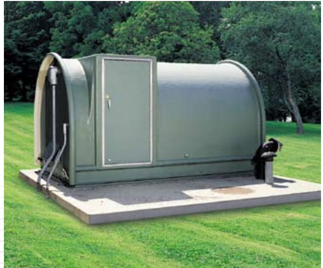
The fiberglass enclosure is resistant to corrosion, mildew, fungus, mold and vandalism.

The fiberglass enclosure resists corrosion, mildew, fungus and mold. The two-way sliding cover provides easy access to all equipment for maintenance or service. The door is made with vandal-resistant hardware for added security. Depending on pump model, pumps are available in 2" to 8" sizes and capacities from 100 to 2100 GPM on single pump operation.