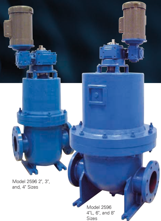
Model 2596 2", 3", and 4" Sizes

Eaton's Model 2596 Automatic Self-cleaning Cast Pipeline Strainers are available in 2", 3", 4", 6", and 8" sizes. A 4"L size is also available which allows for greater flow rates. The Model 2596 is recognized across industries for its continuous flow, simplified maintenance, and worry-free operation.